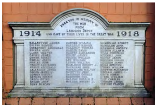
Newlands Tramway War Memorial, 2013

Now demolished. Holmlea Rd/Battlefield Road Glasgow G44 4BJ