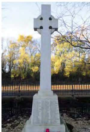
Pollokshaws War Memorial, 2013