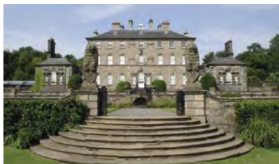
Pollock House, 2013

Pollok Country Park, 2060 Pollokshaws Road, Glasgow G43 1AT