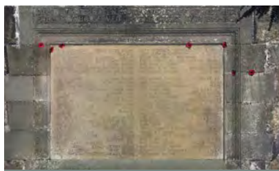
Pollock House War Memorial, 2013