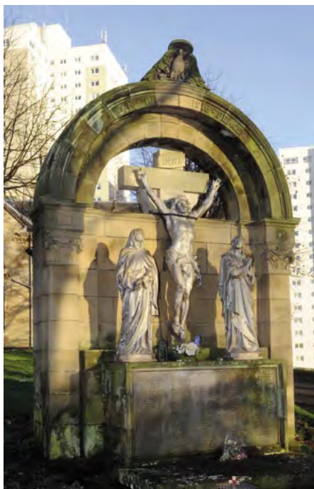
St. Mary Immaculate War Memorial, 2013

This dramatic war memorial can be found off Shawhill Road within the grounds of St. Mary Immaculate RC church. Designed in the form of a large shrine, the monument focuses on a sculpture of Christ on the cross, flanked by two anguished figures with hands clasped in prayer. A number of inscriptions are included, the letters 'I.N.R.I.' upon the apex of the cross (an acronym from Latin for Jesus of Nazareth, King of Jews), the symbols of Alpha and Omega representing the eternal living God, and the words 'War' and 'Peace' across the arch. The names of the congregation who fell are carved into a tablet at the base of the shrine and along with the sculpted dove placed at the top of the arch complete what is a quite exquisite tribute.