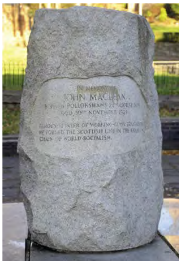
John McLean Memorial, 2013

Opposite 7 MacArthur Street, Pollokshaws, G43 1RU