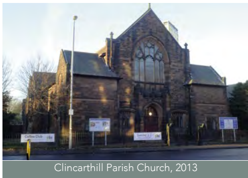
Clincarthill Parish Church, 2013

The Battlefield East Church became the Clincarthill Parish Church in 2010 as the organisation merged with the Mount Florida Church. Two war memorials were related to the Mount Florida institution, an inscribed plaque with timber surround, which was moved to Clincarthill and a War Memorial Hall constructed in 1923 on