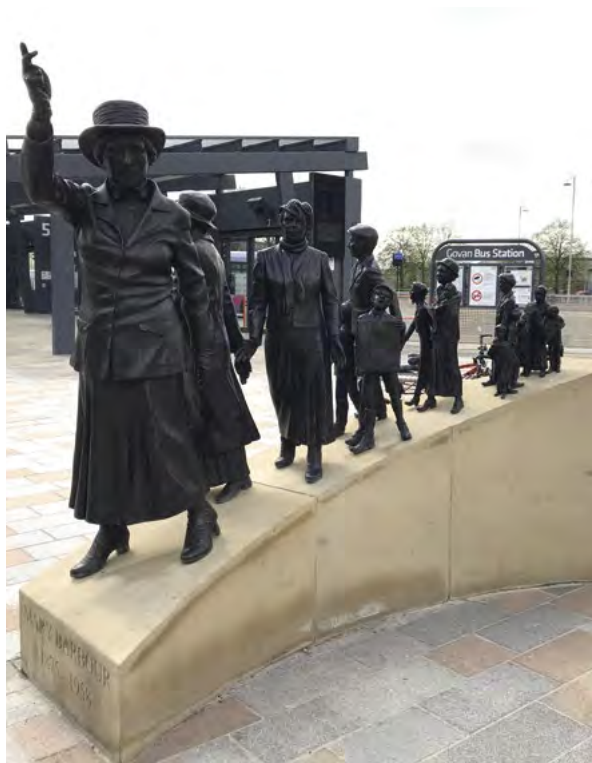
Mary Barbour Memorial, Govan, 2018

The influx of war workers to Glasgow's industries allied to a shortage of housing led to private landlords raising rents, enforcing evictions and profiteering. Mary mobilised local women against this, with the action culminating in thousands protesting at the Sheriff Court on the 17th of November 1915. The movement was successful with the Government responding through the introduction of the Rent Restrictions Act which fixed the rent of small dwellings to pre-war levels. Mary continued her political