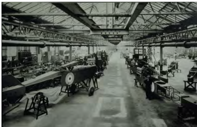
Aircraft assembly line by Weir of Cathcart, WW1

Holm Foundry, 147 Newlands Road, G44 4ER