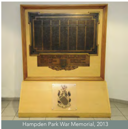
Hampden Park War Memorial, 2013

Queen's Park Football Club was greatly affected by the First World War, with 250 members and players of the club enlisting (nearly 50%), 29 of whom lost their lives. A brass tablet listing these names was originally located in the reading room of the club's pavilion and can now be found within Hampden Stadium. Football in Scotland struggled during the war with the Second Division being disbanded, the Scottish