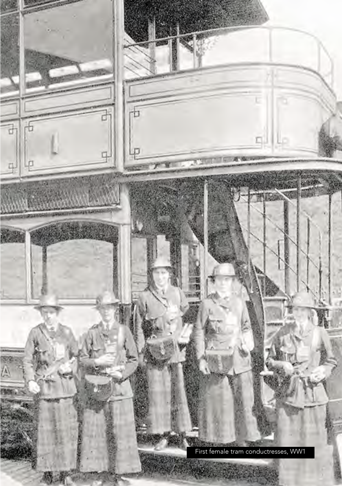
First female tram conductresses, WW1