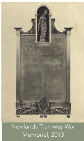
Newlands Tramway War Memorial, 2013

Now demolished. 117 Riverford Road, Glasgow G43 1PU