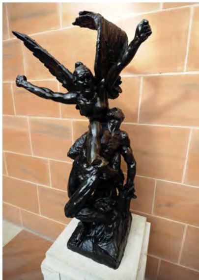
Rodin's 'The Call of Arms', The Burrell Collection, 2013

Pollok Country Park, 2060 Pollokshaws Road, Glasgow G43 1AT