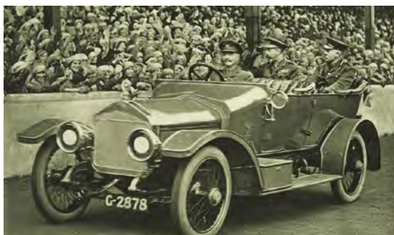
King George V, Ibrox Stadium, 1917