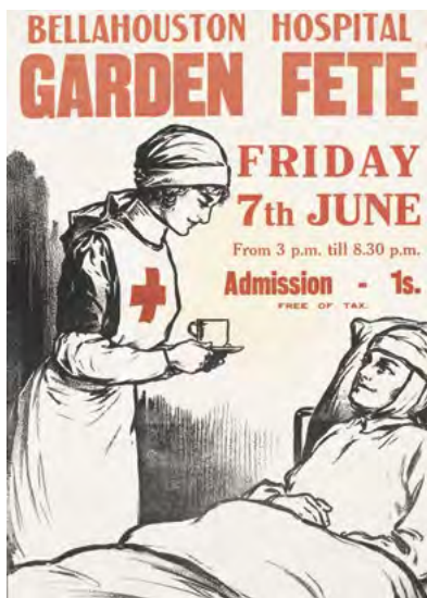
WW1 Red Cross Poster