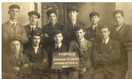
Govan Road Shipbuilding Apprentices, WW1

There were two major shipyards within Govan at the time of the First World War, to the east the Harland & Wolff yard (originally Napier's) and to the west the Fairfield Shipbuilding and Engineering Company (once John Elder & Co). In 1914 the latter was one of the three companies in Glasgow designated as naval dockyards